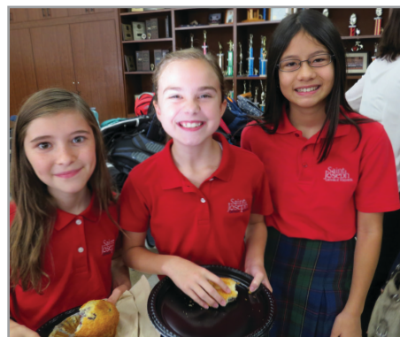
Sixth graders attend the leadership pep rally and breakfast to kick off their last year at Saint Joseph.